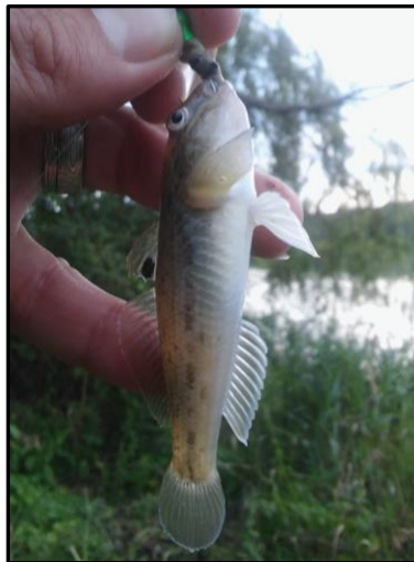
A round goby, Neogobius melanostomus , taken from Cayuga Lake, NY.