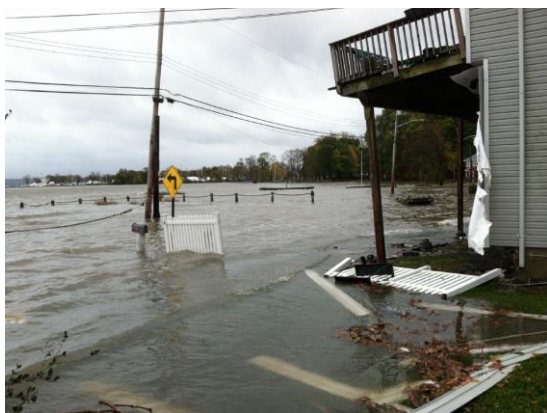
View of flooded road in Stony Point following Hurricane Sandy in 2012

State and federal agencies offer financial assistance to municipalities and non-profit organizations for activities building resilience to waterfront flooding, sea level rise and other climate risks. This document provides an overview of these assistance programs and how to apply. Eligible activities include municipal planning, improving the resiliency of structures, emergency management planning, waterfront revitalization, public outreach, and floodplain protection. A summary table of all resources, organized by agency, areas of assistance and deadlines, can be found at the end of this document.